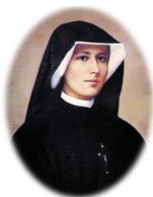
St. Faustina Kowalska

Divine Mercy for America responds to the “signs of the times” by tracing out a path for people of faith, particularly Catholic Christians, to follow in the footsteps of Saint Faustina by employing the same prayers, promises and sacrifices for America that she offered the Lord for Poland.